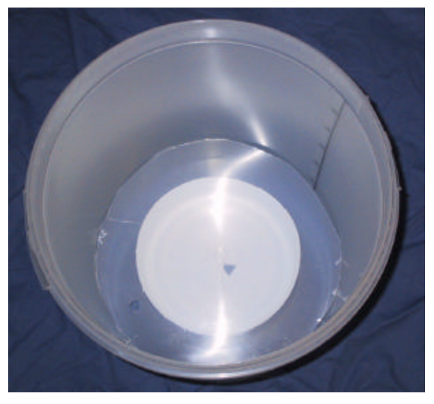
plate that is a perfect fit. Remember to place it high enough to give a tiny gap all around for the alcohol to run past.

Over this support I have placed plastic disc. This is cut from the lid of a fermentation vessel. Cut the disc so that there are as small gaps as possible round the edge. The disc should be 320 mm in diameter. In the picture one can see I have cheated a bit, but it gives an idea of how accurate it should be. The disc is there to separate the alcohol from the air in the vessel. A nice touch is to order a glass disc from a glazier. This should be more than 4 mm thick and have a diameter of 317 mm with bevelled edges for safety. Cost is about 15 Euros. Such a disc gives a bottom